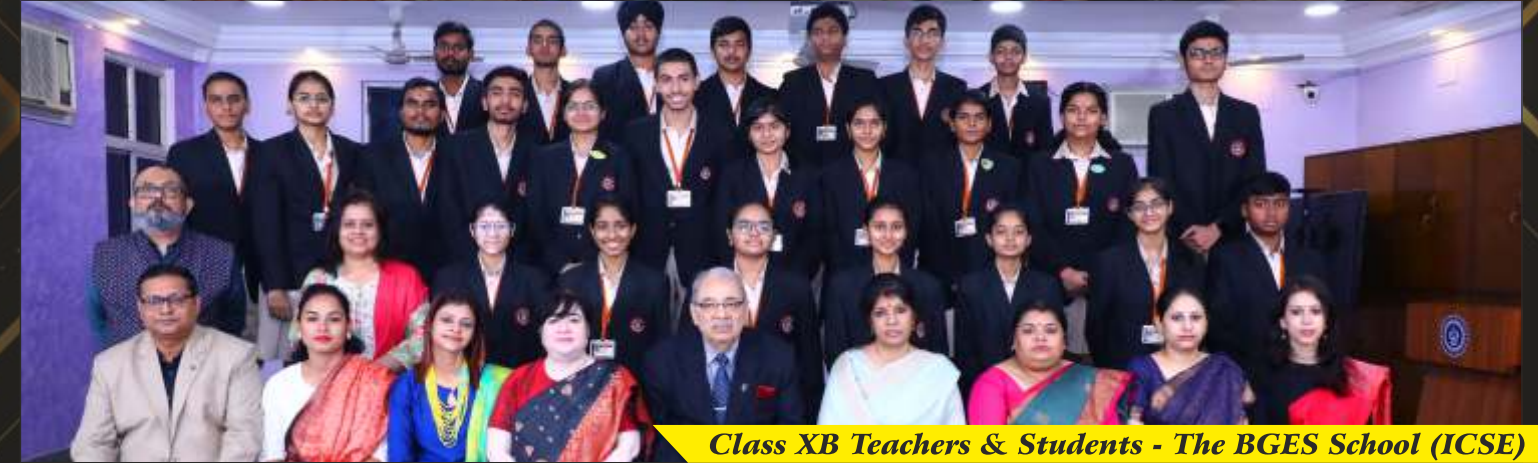
Class XB Teachers & Students - The BGES School (ICSE)