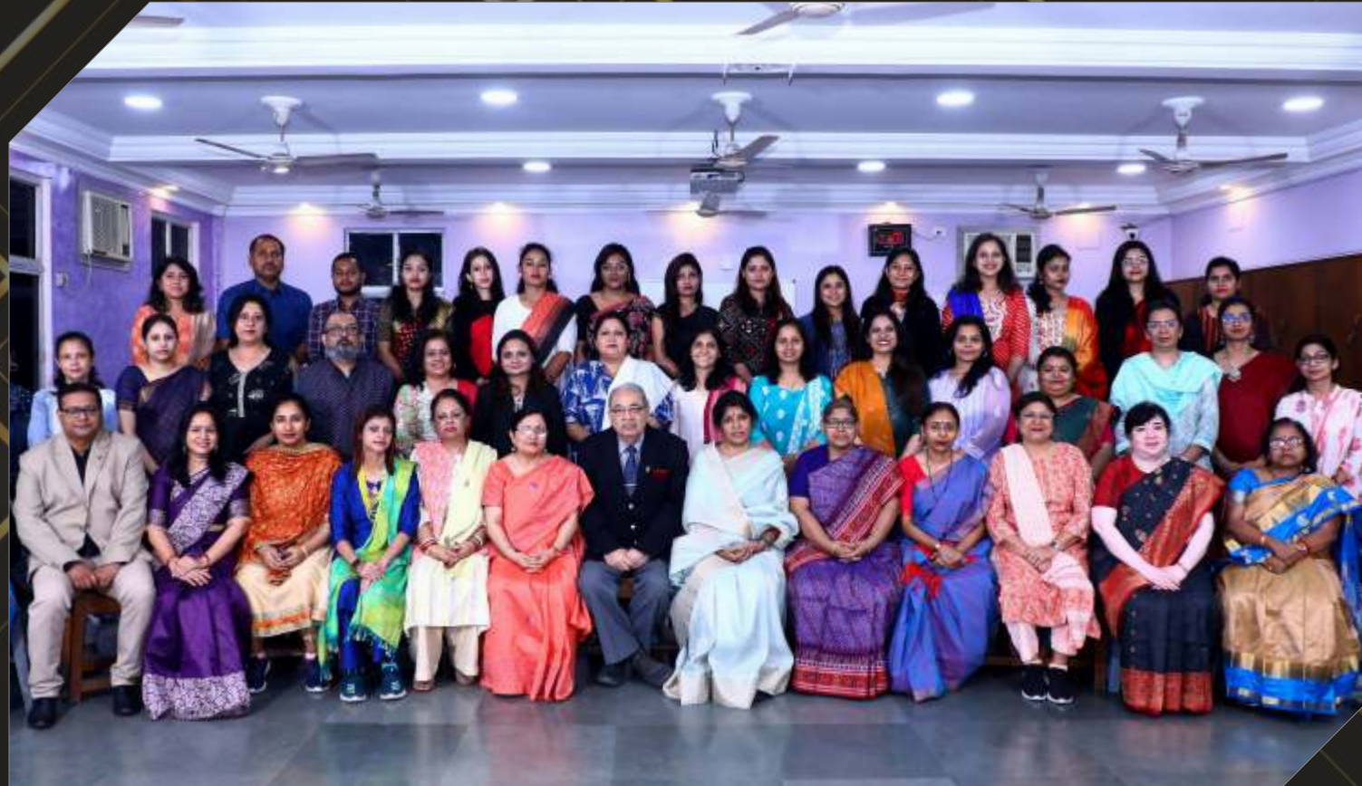
All Teachers - The BGES School (ICSE)