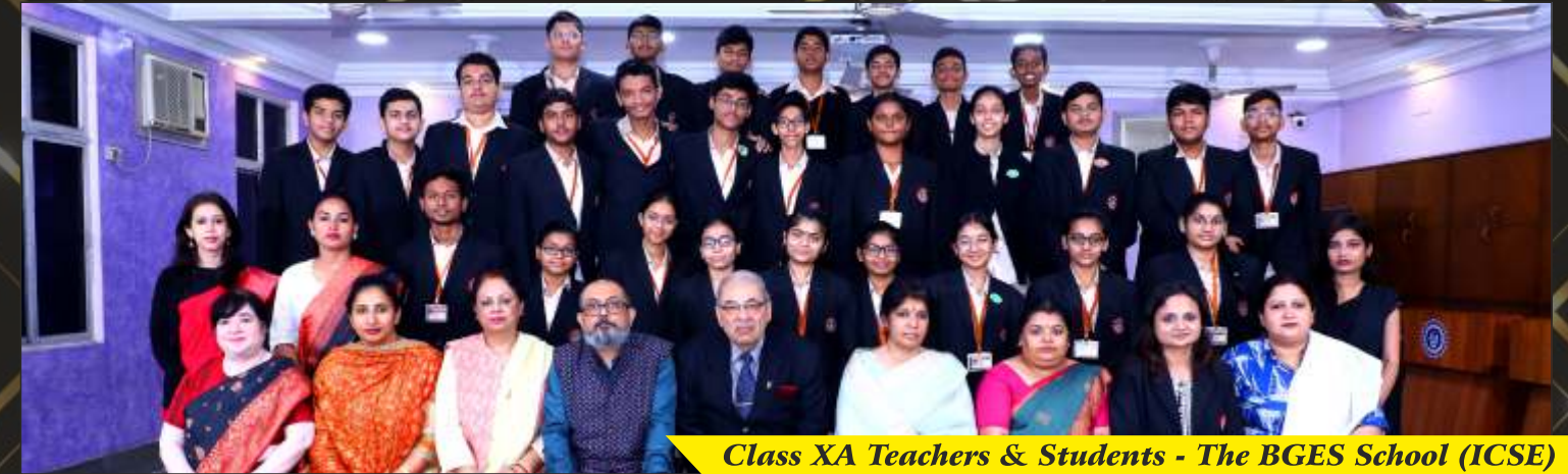
Class XA Teachers & Students - The BGES School (ICSE)